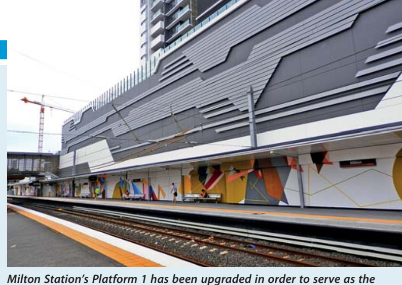
primary platform catering for Suncorp Stadium events.

Structural Engineering Consult:. Webb Consulting