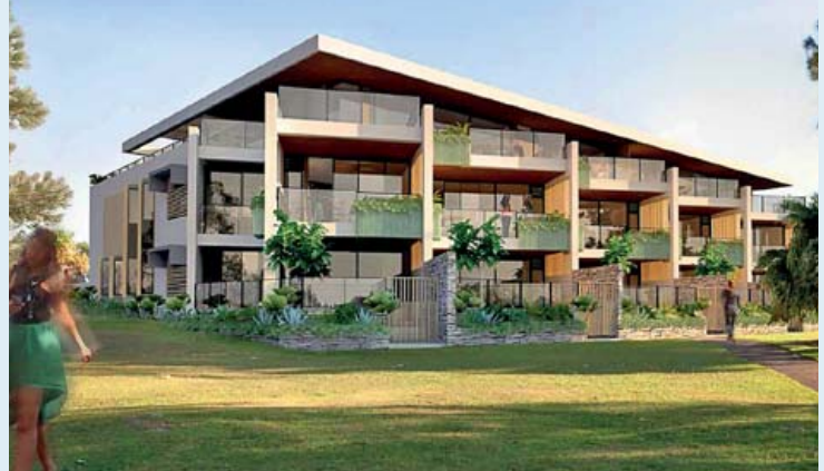
Nine luxury, beachfront apartments are under construction in Lawson Street, Byron Bay.

Job Description: The QGC house at Tara is a four-bedroom, two-bathroom, slab on ground, brick veneer house with dual living areas and fully air conditioned. The house was constructed for QGC as part of its work for the regions program as a full turn key package with all floor coverings and furnishings included. This project was completed