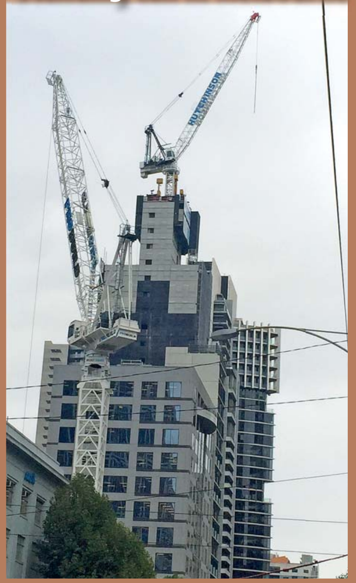
HUTCHIES' name is standing tall in the Melbourne CBD as the $34 million Carlson Apartments building in La Trobe Street tops off at 35 storeys. The 149-apartment residential tower is due for completion in December.