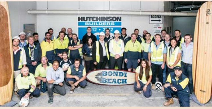
Looks like Sydney team members are looking forward to going surfing when the Pacific Bondi project is finished later this year.

A QUARTERLY NEWSLETTER FOR HUTCHINSON BUILDERS