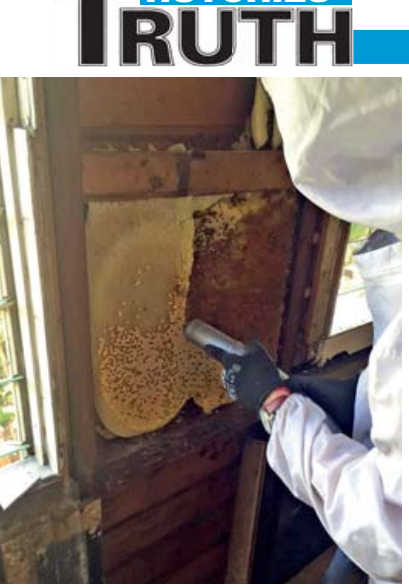
Swarm of bees being removed from a wall cavity during a Hutchies' house demolition in Highgate Hill.