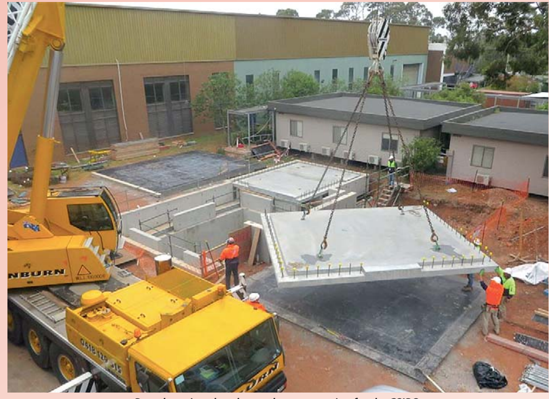
Reverberation chamber under construction for the CSIRO.

A MAJOR project for the CSIRO by Hutchies has included refurbishment of 12 existing buildings and construction of four new buildings at Clayton in Victoria.